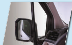
Wider Quarter Panel for Enhanced Driver Visibility