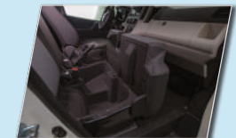
Seat Under Compartment