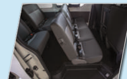
Increased Leg Room