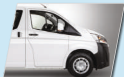
Semi-Bonnet Body Type