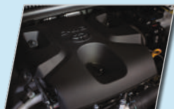
1GD-FTV Engine with 6 Speed MT Transmission