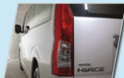
LED Tail Lights