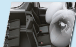
Additional Airbag for Center Passenger